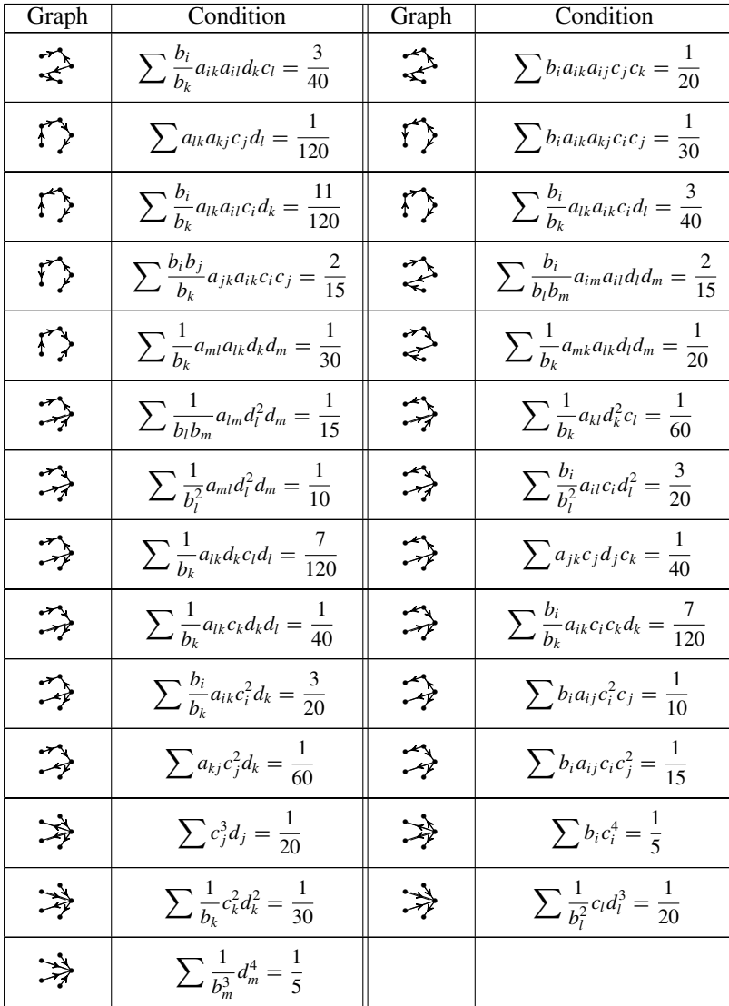
Table 6 Ordre 5

Acknowledgements We thank the associated editor and two referees for their useful remarks.